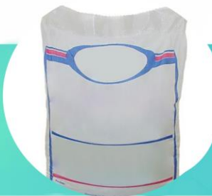
50 Kg bag